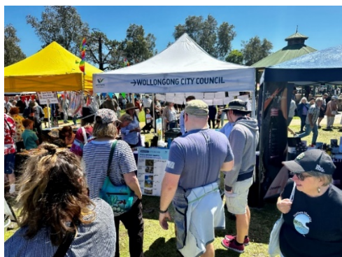
Helensburgh Lions Country Fair 26 October 2024