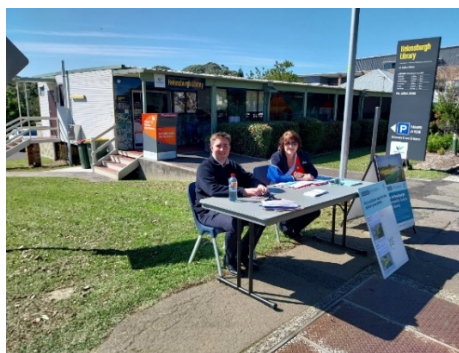
Helensburgh Library 17 October 2024