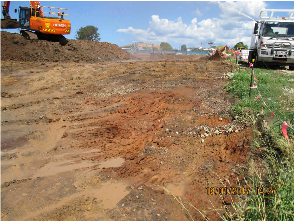
Public roadway condition: