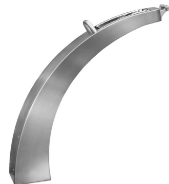
Site 2: Drink fountain with dog bowl & tap