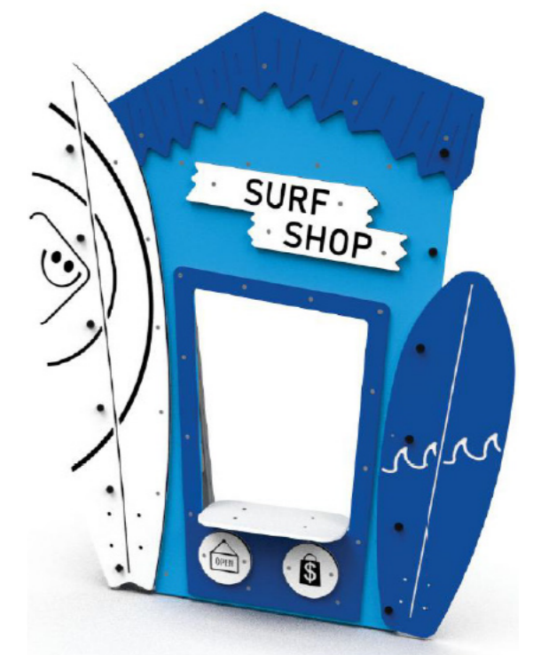
Surf Shack Play Panel