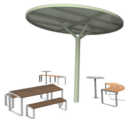
Site 3: Circular shelter, picnic setting & seat