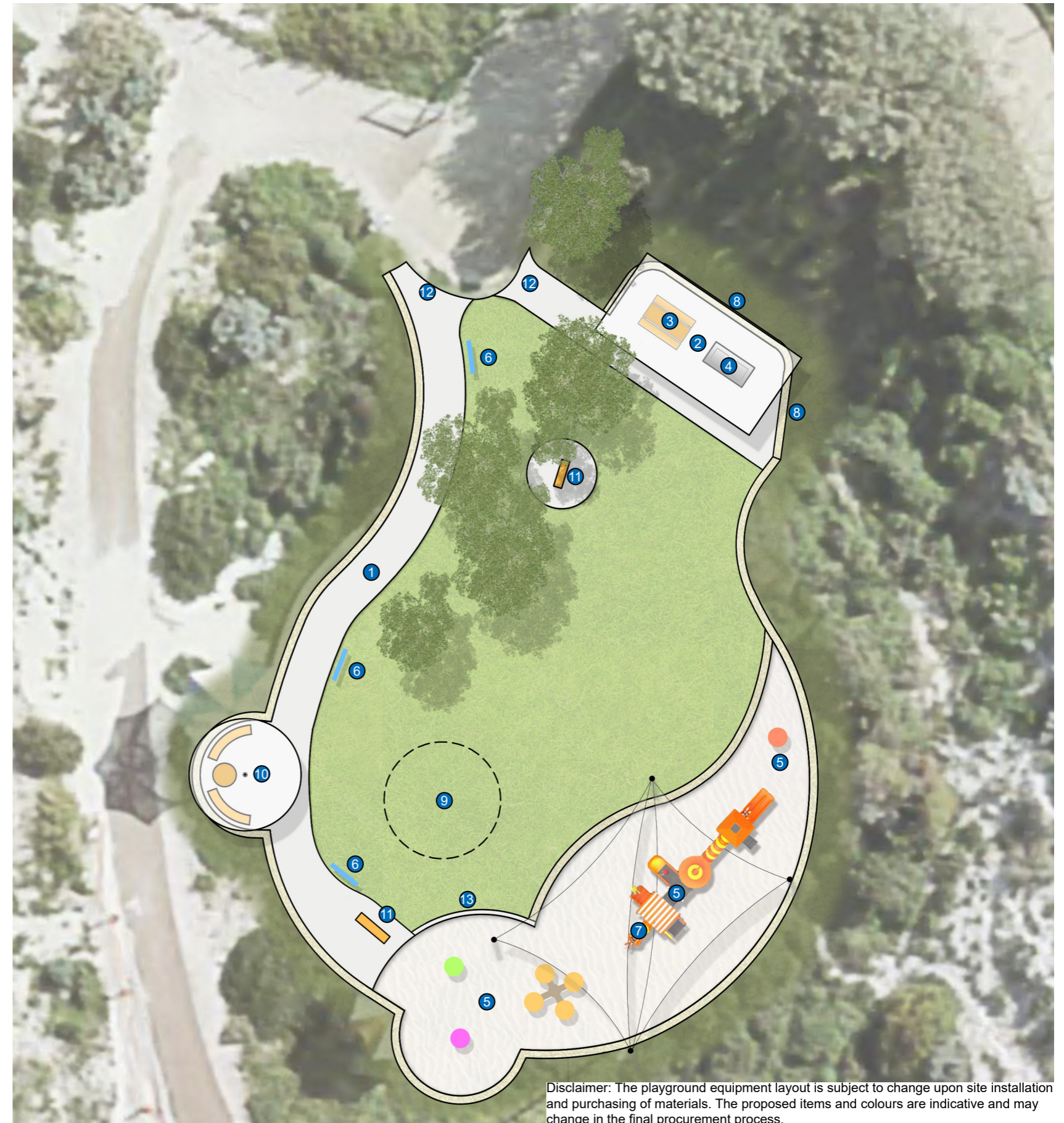
Site 1: Scale 1:200 @ A3

Disclaimer: The playground equipment layout is subject to change upon site installation and purchasing of materials. The proposed items and colours are indicative and may change in the final procurement process.