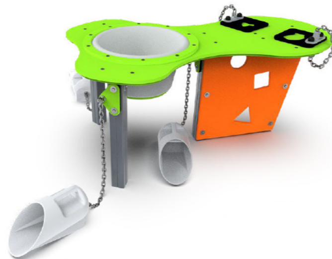
Sand Play Station