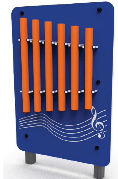
Musical Play Panel