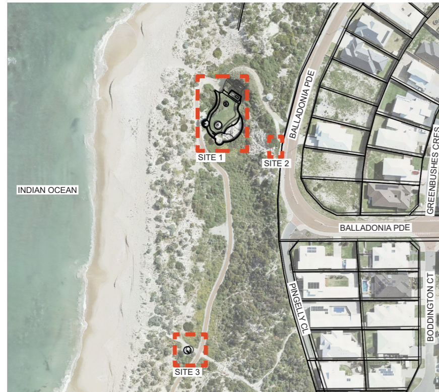
Location Plan: Scale 1:2500 @ A3