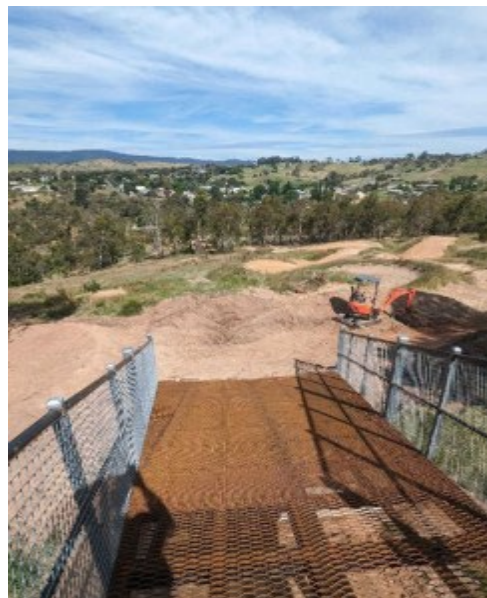
The newly completed overpass is looking good and connects recently completed trails, including the Pioneer trail.

Pioneer Lookout, which offers fantastic views out over the valley and town. These additional sections take the total trail length to 15km.