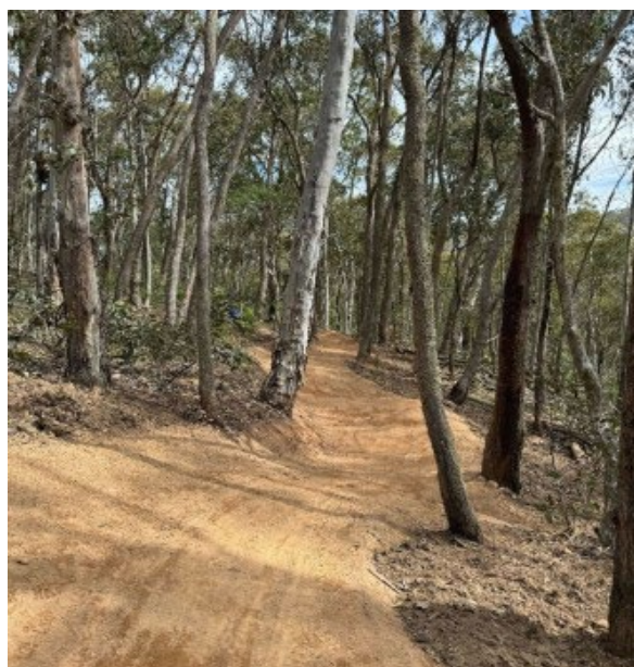
The XC6 “Pioneer” trail weaves through the historical mining areas of the Oriental Claims area and is looking spectacular.

The 1 km-long Water Race trail is accessed from the Oriental Claim trailhead and takes riders along Dry Gully Creek, crossing the creek at the halfway point of the trail then connecting to the Mine Bender trail.